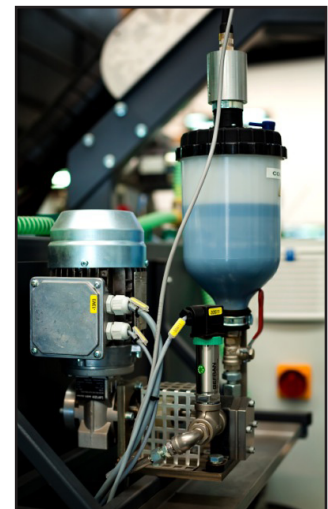
Colour & Additive Dosing