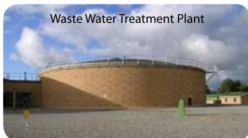
Waste Water Treatment Plant

Futura-Bond 415 metal primer was first applied after sand blasting the steel surface, then a 50mm layer of Stepanfoam RS3011 48Kg/m³ sprayfoam before finishing off with a 5mm coating of Eraspray ESM900 elastomeric spray coating . The refurbished digester is now set for another 20 years plus of operation!